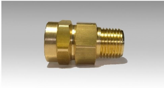
NIPPLE (3 PIECES) ASSEMBLED