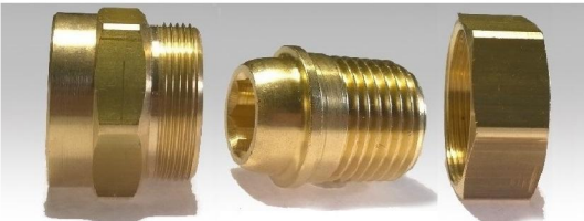
NIPPLE (3 PIECES) NOT ASSEMBLED